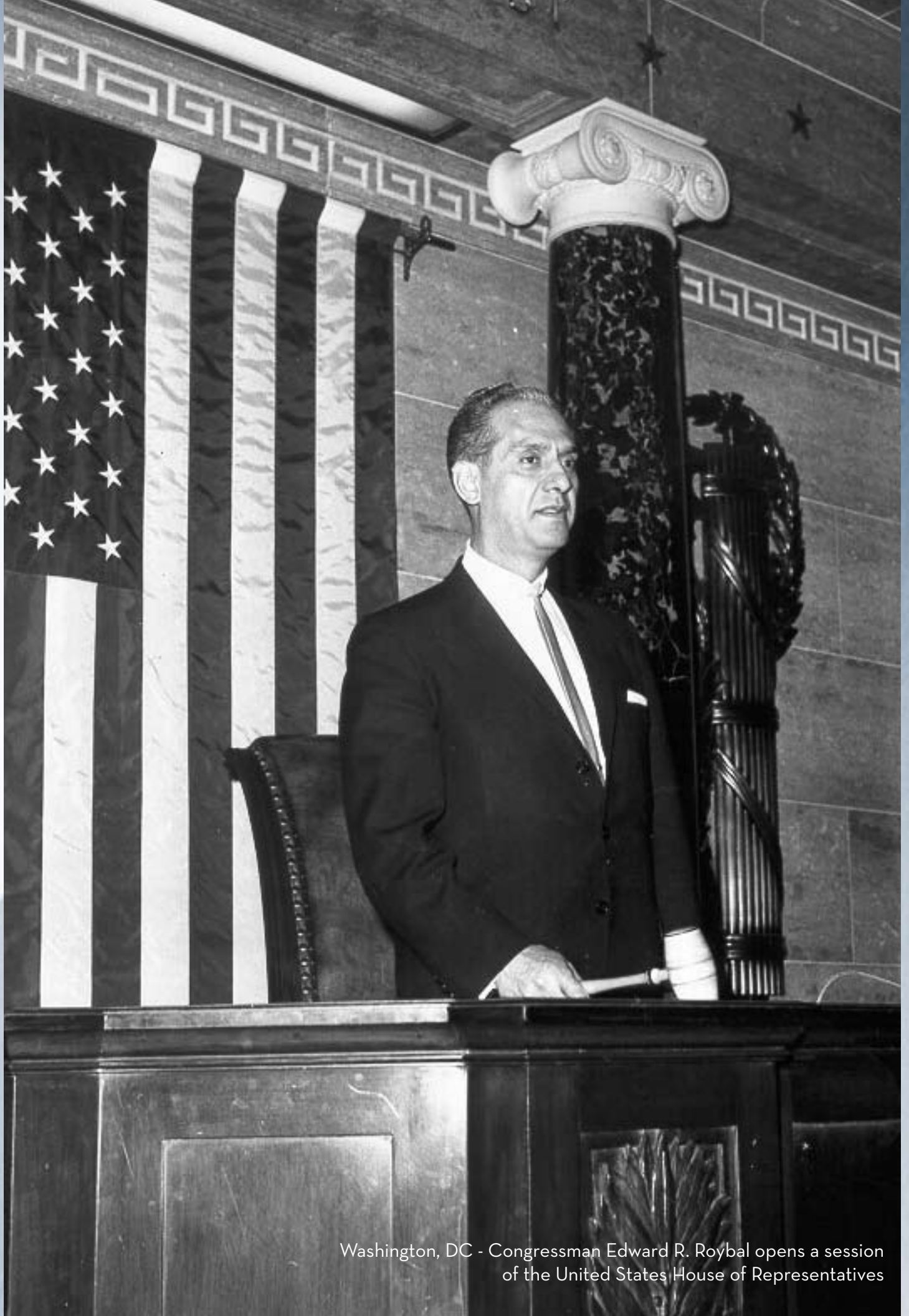
Washington, DC - Congressman Edward R. Roybal opens a session of the United States House of Representatives